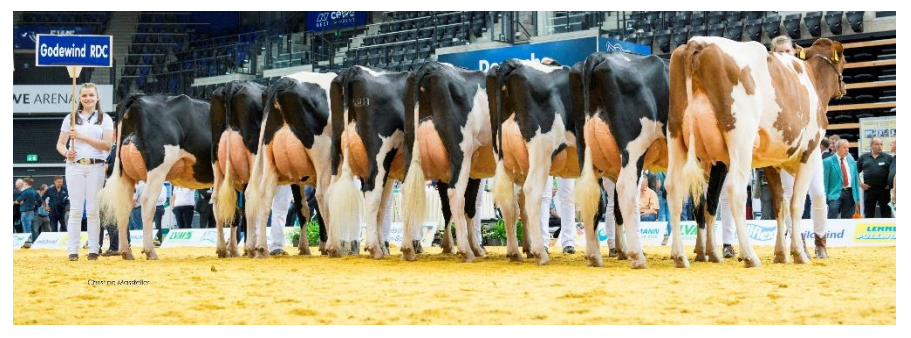
The daughters of the popular sire Godewind RDC (Gold Chip x Sanchez x Goldwyn) during the German Dairy Show in 2019.