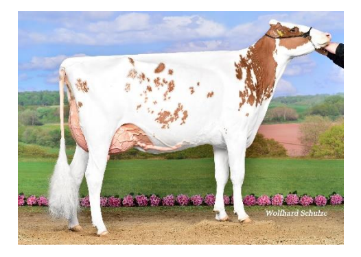
FG Natalie 3/EX 92 (Sire: Mad Max) Red and White German Champion 2019

German Livestock Association (BRS) • Adenauerallee 174 • D-53113 Bonn Tel: +49 (0)228 914 47 50 • Fax: +49 (0)228 914 47 55 holstein@rind-schwein.de • www.rind-schwein.de