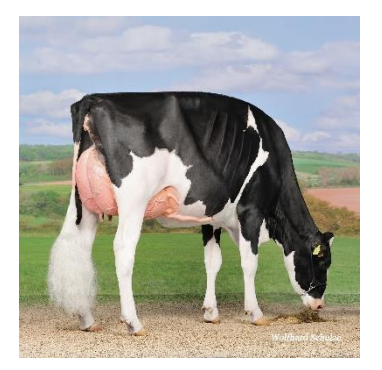
Loh TJ Alessja 3/EX 92 (Sire: Armani) Black and White German Champion and 2019