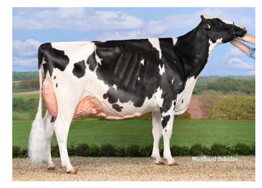
Fux Seattle 6/EX 96 (Sire: Gold Chip) Highest excellent cow in Germany