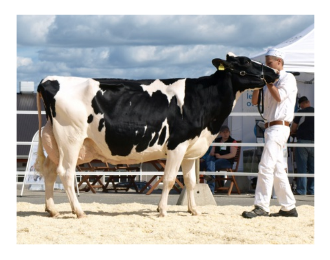
Vice Champion and winner of cows 2 times calved BraKo Shottle Sonya (Shottle x Jordan)

Holstein Champion and winner of cows 4 or more times calved Gårsby Stormatic Villarosa (Stormatic x Lee)